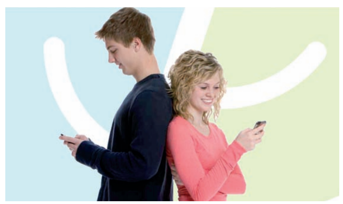
Gender-based violence and responsible use of social media, Cover of a booklet for the LOG IN project, Source: ALEG Association.20

of local authorities and multistakeholder support from three countries: Cyprus, Italy and Lithuania.