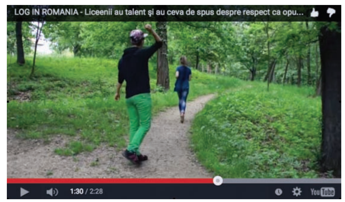
Gender-based violence storified. Screenshot of an award-winning video from the LOG IN project.21